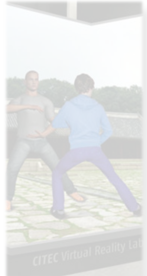
Personal Supportive Coach