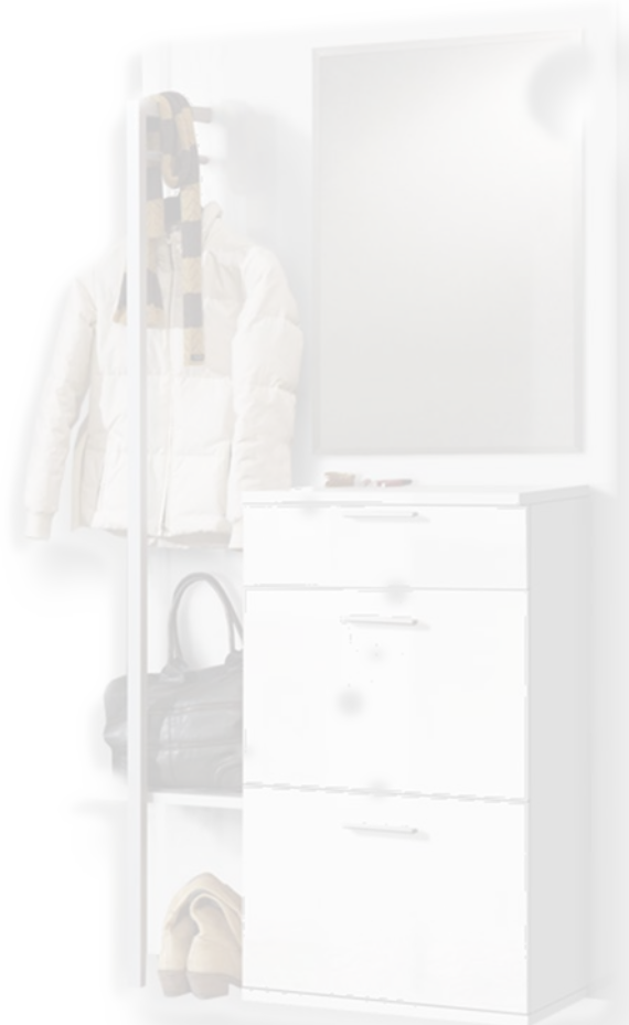
Intelligent Entrance Hall